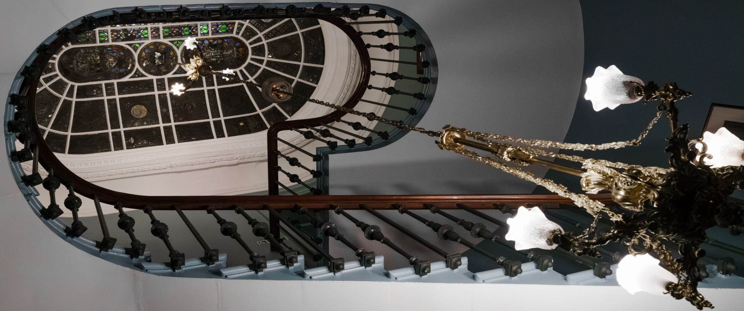
The grand staircase leading up to the 19 bedrooms in the Hall