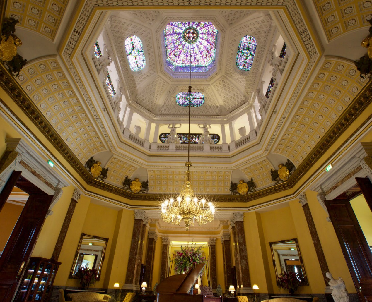
The magnificent Statue Gallery at Wynyard Hall has welcomed guests for over two centuries and is a truly outstanding feature of Wynyard Hall.

In the past two years, Wynyard Hall has undergone a strategic shift, transitioning from a traditional hotel to a venue exclusively focused on hosting weddings, celebrations, meetings, conferences and events.