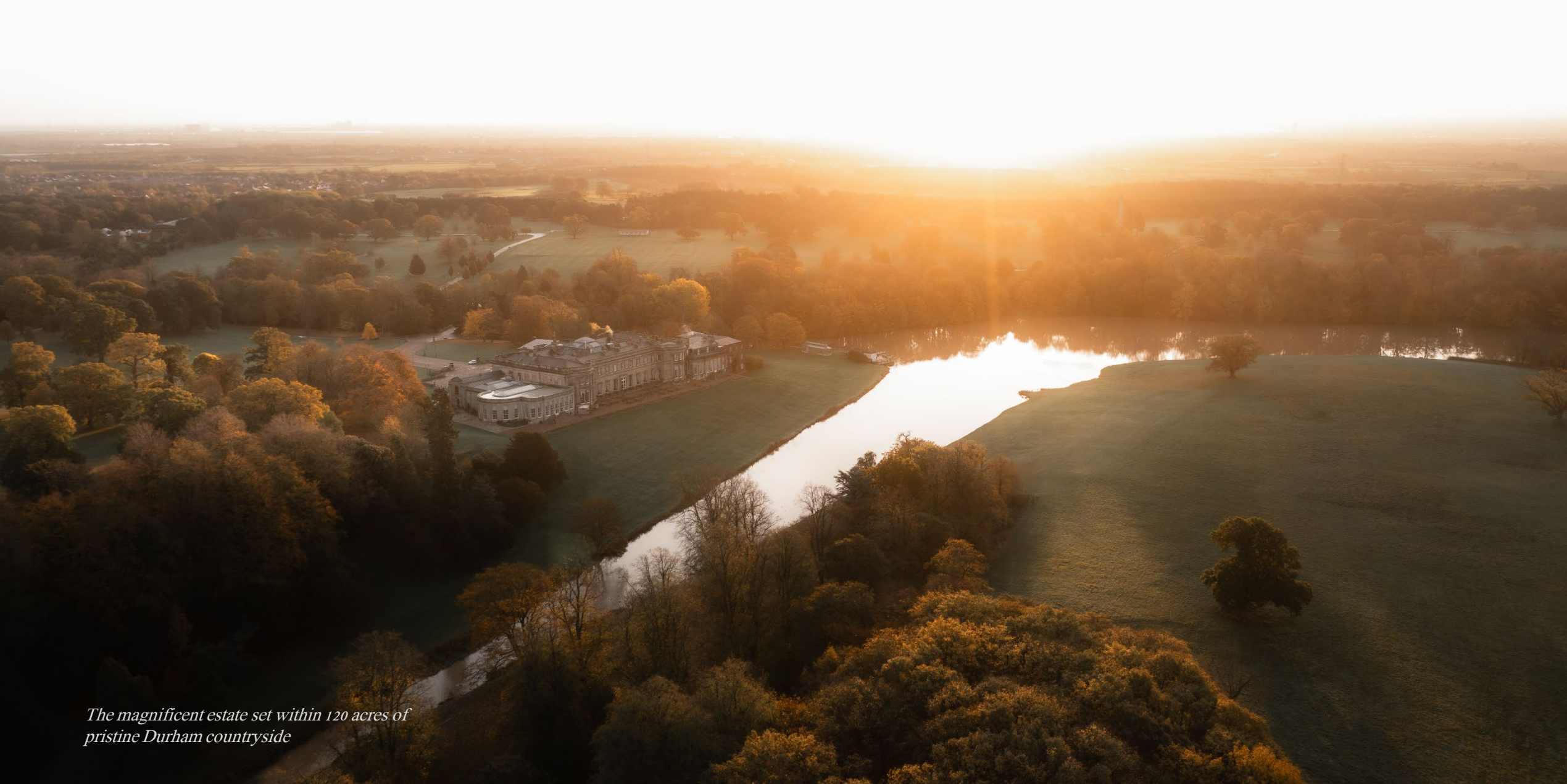
The magnificent estate set within 120 acres of pristine Durham countryside